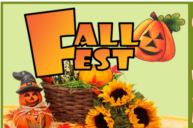
PHOTO SPOT CAKE WALK POPCORN & SLUSHIES (WHILE SUPPLIES LAST) BICYCLE GIVEAWAY AMAZON TABLET GIVEAWAY

Oct. 20: ALL about change! Bring spare change for OCC.